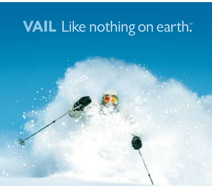
Winter Trail Map 2009-2010

Welcome to Vail, an experience like nothing on earth.